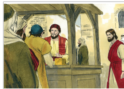
Jesus Calls Matthew