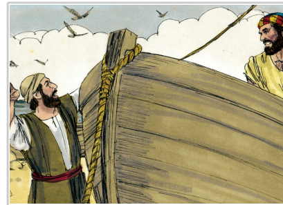
Fishers of Men