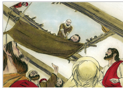
Jesus Heals a Paralytic