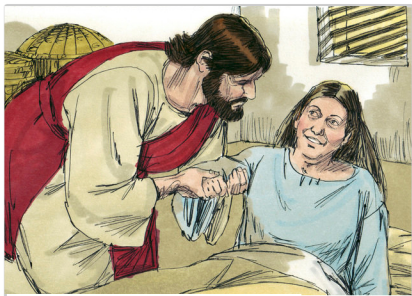
Jesus Heals Peter's Mother in Law & Others