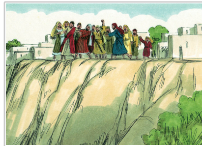
Jesus Rejected in Nazareth