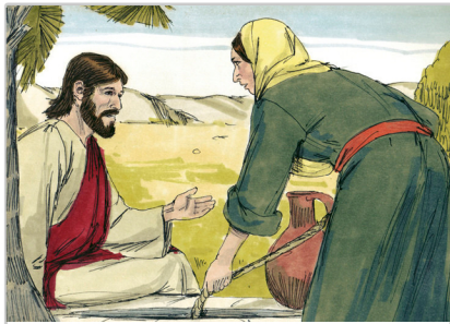
The Samaritan Woman