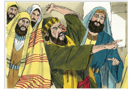
Jesus heals a Demoniac on the Sabbath