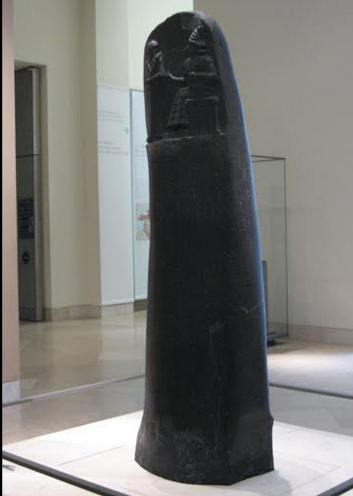
Code on diorite stele.

The code is inscribed in the Akkadian language using cuneiform script